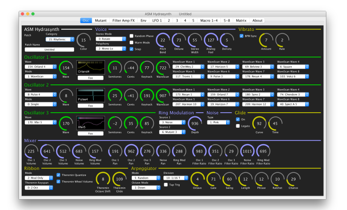
Figure 5: Edisyn patch editor pane for the ASM Hydrasynth showing the first tab pane ("Osc": oscillators, voice and controller parameters, and the mixer). More parameters are found on additional tab panes.

The way a patch editor talks to a synthesizer is via MIDI, a standardized communication protocol for synthesizers to talk to one another and to computers. Synthesizers can be programmed remotely via MIDI: indeed some can only be programmed via MIDI, as in the synthesizer in Figure 4.