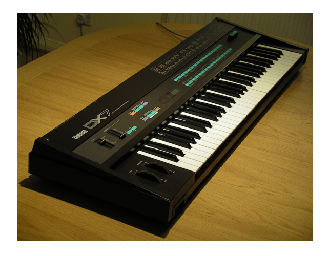
Figure 6: Yamaha DX7.

Thus the string 0xF0 0x43 defines a namespace that only Yamaha synthesizers will respond to.