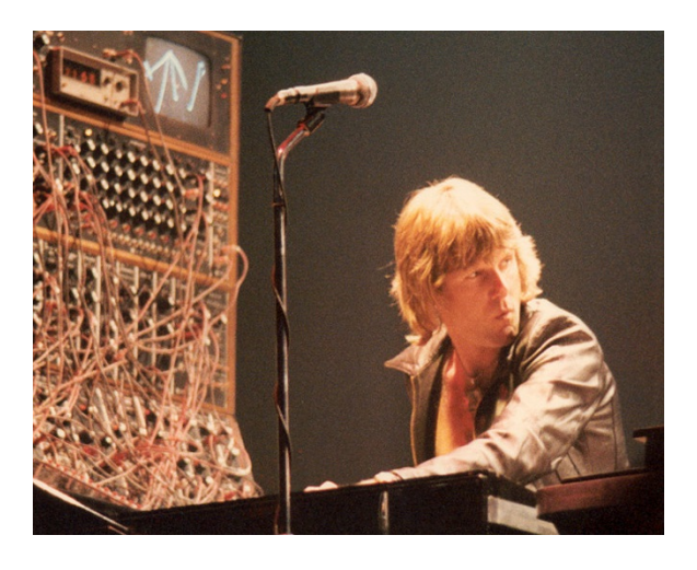
Figure 1: Moog modular synthesizer being played by Keith Emerson. Note the vertical modules with knobs and patch cables.

This paper is organized as follows. Section 2 introduces the notion of patch editors. Section 3 is a tutorial on MIDI and System Exclusive. Section 4 introduces a music synthesizer's memory model, and Section 5 discusses common interactions with a synthesizer needed to build a patch editor for it. Sections 6, 7, and 8 offer case studies for three classic synthesizers, the Yamaha DX7, the Dave Smith Instruments Prophet '08, and the Waldorf Blofeld, which illustrate how MIDI is used, how their internal models differ, and the challenges of writing software to work with each of them. Section 9 details the very wide range of absurd decisions made by manufacturers which unnecessarily complicate the development of patch editors for their products and which you will almost certainly encounter. Finally Section 10 laments recent trends in synthesizers which portend the end of tools to assist them for the benefit of the community.