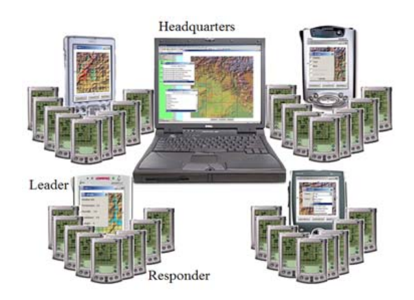
Figure 3. An instance of EDS application.

The domain of emergency and response is by its nature unpredictable. For instance, it is completely conceivable that due some to unforeseen event the Headquarters fail, in which case it is desirable for a designated Leader to assume the role of the Headquarters. On top of