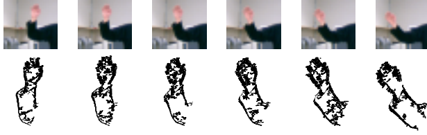
Figure 1. Upper row: Frames 1,3,5,7,9, and 11 from a 13-frame image sequence. Lower row: Normal flow computed for the lower arm regions of the corresponding upper row images.