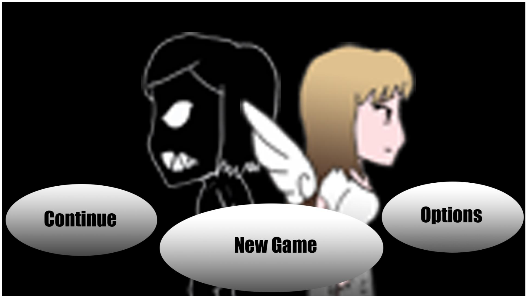
Example of the title screen.