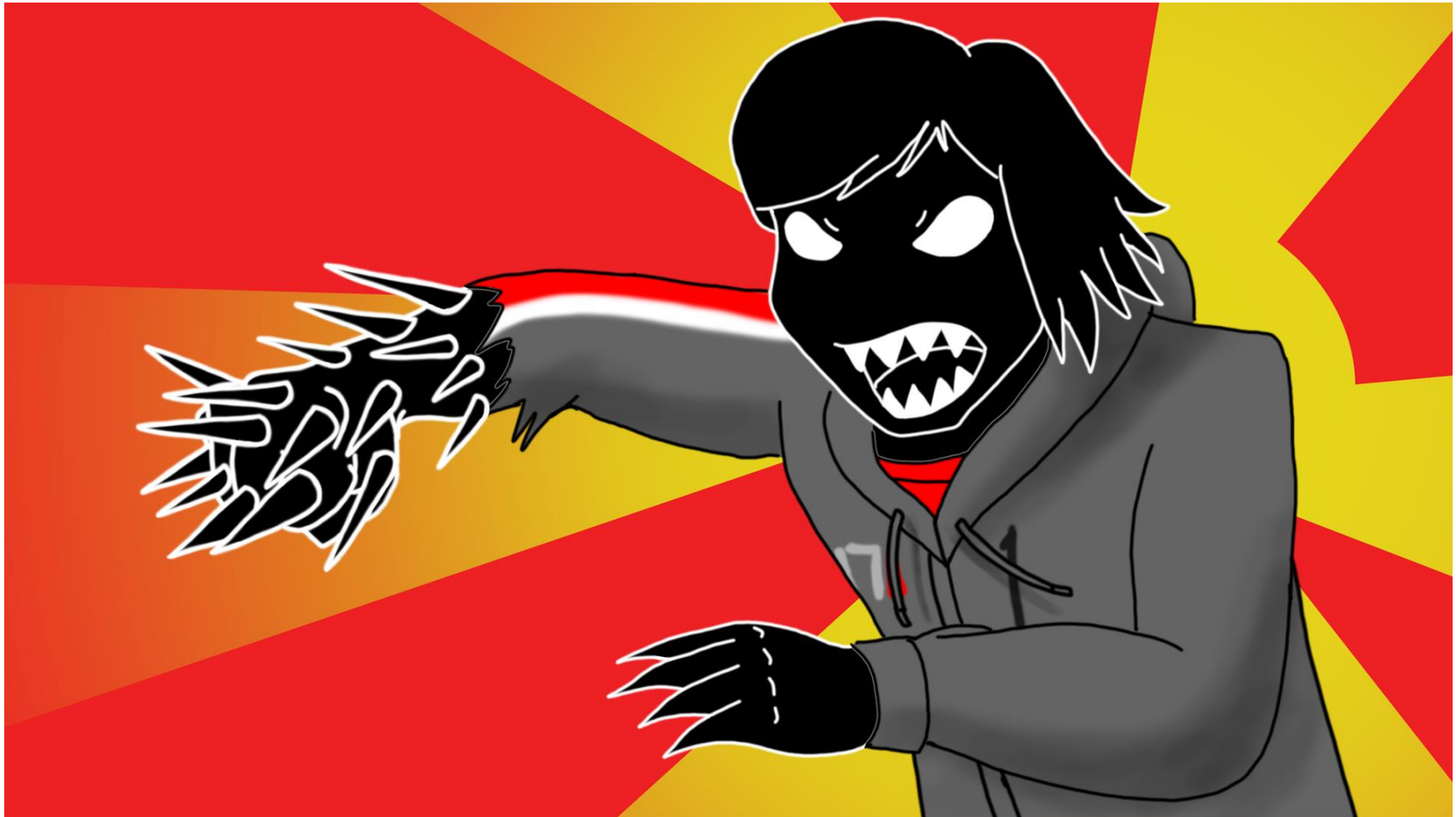
An example of the types of abilities being used, here the “Spike ability.”