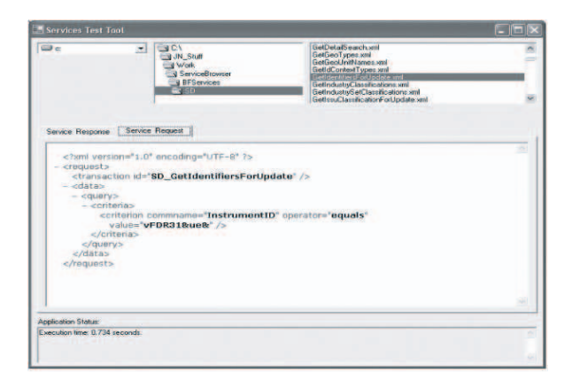
Figure 4. ServiceTest

tool generates an XML request document for a chosen service, executes the service, and displays execution results.