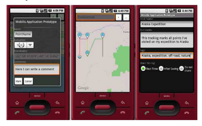
Figure 3: Screenshots of TrackService

Bus4Blinds is an application that notifies a person with serious visual impairment waiting at a bus stop when a bus of a selected line is approaching the bus stop where the user is waiting. The notification is symmetric, meaning the bus driver is also notified of the presence of the bind person at the stop.