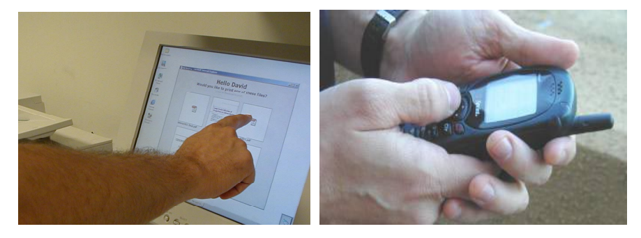
Figure 1. Two key design alternatives for ubiquitous systems: embedded (left) or portable (right) interfaces.

Thus, we developed two PIPs variants: embedded PIPs which provide an interface connected to the device itself, e.g., a touch screen (figure 1 left); and portable PIPs which users access via portable devices, e.g. mobile phones or PDAs (figure 1 right). We varied this decision because we were not certain which approach would be most appropriate. For instance, would users feel comfortable accessing their private data via a public device? Would they feel better accessing their data via their own cell phone? What if users forget their cell phones or wireless connectivity is unreliable? Are larger, embedded user interfaces inherently more usable than tiny, portable interfaces provided by cell phones and PDAs?