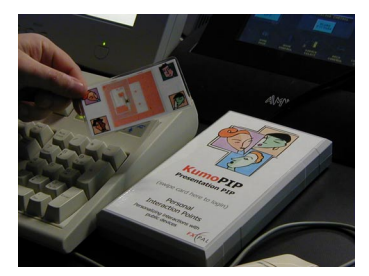
Figure 4. A user logs into an embedded PIP interface by swiping an RFID card.

The embedded PIP interface is activated when the user approaches the shared device and swipes their smart card over the card reader (Figure 4). In our current implementation we use 32 bytes of rewritable storage on each smart card to store an encrypted version of the user's NT password. The PIP system reads the unique card ID and encrypted password from the card and creates an NT authenticated process which is effectively logged-in as the user. Once authenticated the PIP-enhanced device provides feedback by displaying a splash screen with the user's name and picture indicating they have been recognized.