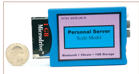
Figure 4. Intel Research's Personal Server, a prototype system that combines powerful processing, high-density storage, and a Bluetooth radio.

Bluetooth-enabled cell phone, now available commercially from Ericsson, that will be able to take advantage of localization data while connecting to the cellular network.