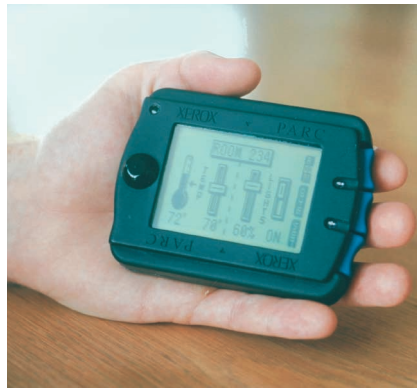
Figure 1. Xerox PARCTab, the first context-aware personal digital assistant.

To date, the most successful commercial mobile com-