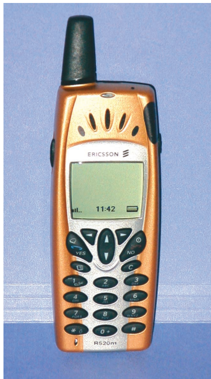
Figure 3. Ericsson's R520m Bluetooth-enabled cell phone, one of the many Bluetooth products that can take advantage of data localization.

The Bluetooth short-range radio standard might be particularly well suited to the creation of location-based services. Already, several companies have announced Bluetooth location-based services and positioning technology (for example, Bluesoft Inc.), and a Local Positioning Working Group of the Bluetooth SIG has been charged with providing interoperability among devices from different suppliers. Figure 3 shows a