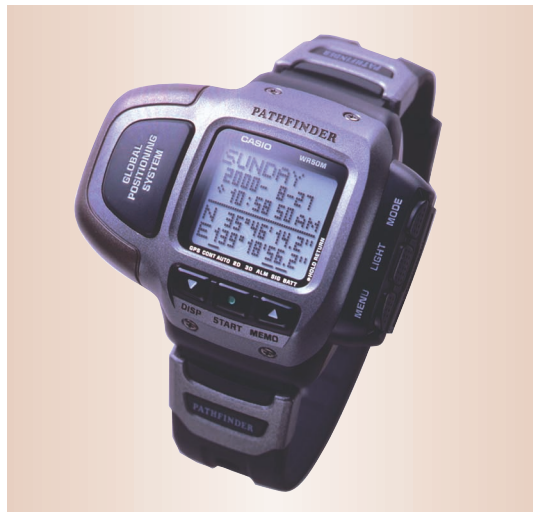
Figure 2. The Casio Pathfinder GPS watch.

The new e911 requirements effective in the US as of 1 October 2001 require that 95 percent of emergency-services calls made from mobile handsets be locatable to within 150 meters. The same mechanisms that enable emergency services to respond to the location of a caller will likely be made available to higher-level services, which in turn will provide an API for developers. Application writers can use this interface to augment existing applications or invent entirely