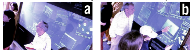
Figure 4. Shelter from the rain

The presence of other users is important to the way new users arrive at the display. In 19% of the cases, CityWall was already in use by someone else when a new user entered the display and started using it. Given that the display was in use 8.8% of its total uptime, this indicates very sim-