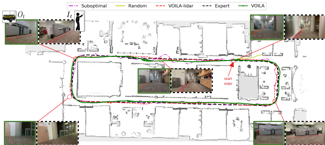
Fig. 1: Policy rollout trajectories of the VOILA agent (green) successfully imitating a demonstration behavior (black) of patrolling a rectangular hallway clockwise. The demonstration consists of a video gathered by a human walking while using a handheld camera that is considerably higher than the robot’s camera (introducing significant viewpoint mismatch). We see that the VOILA agent is able to successfully imitate the expert demonstration even in the presence of this egocentric viewpoint mismatch.

the-shelf keypoint detection algorithms that are themselves designed to be robust to egocentric viewpoint mismatch. This novel reward function is utilized to drive a reinforcement learning procedure that results in navigation policies that imitate the demonstrator.